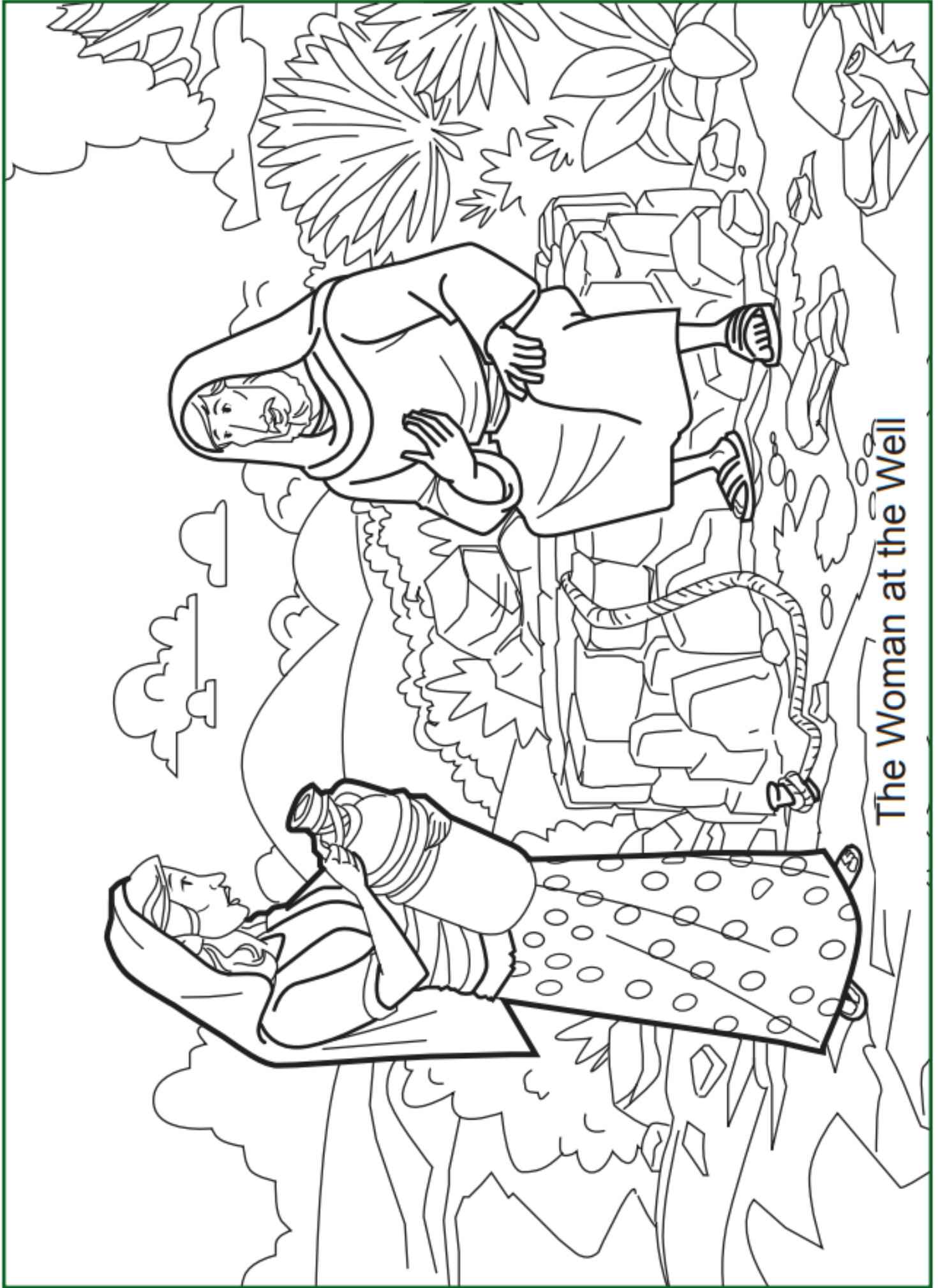
The Woman at the Well